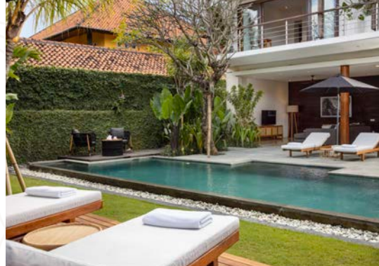
Villa Ambara, 3-Bedrooms