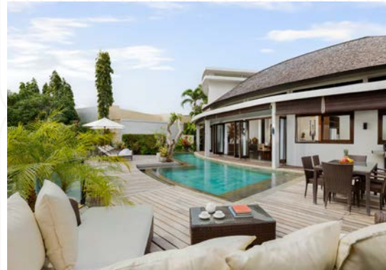
Villa Oshra , 4-Bedrooms