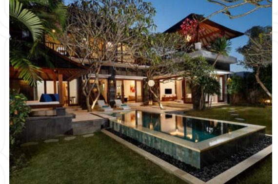
Villa Sophie, 3-Bedrooms