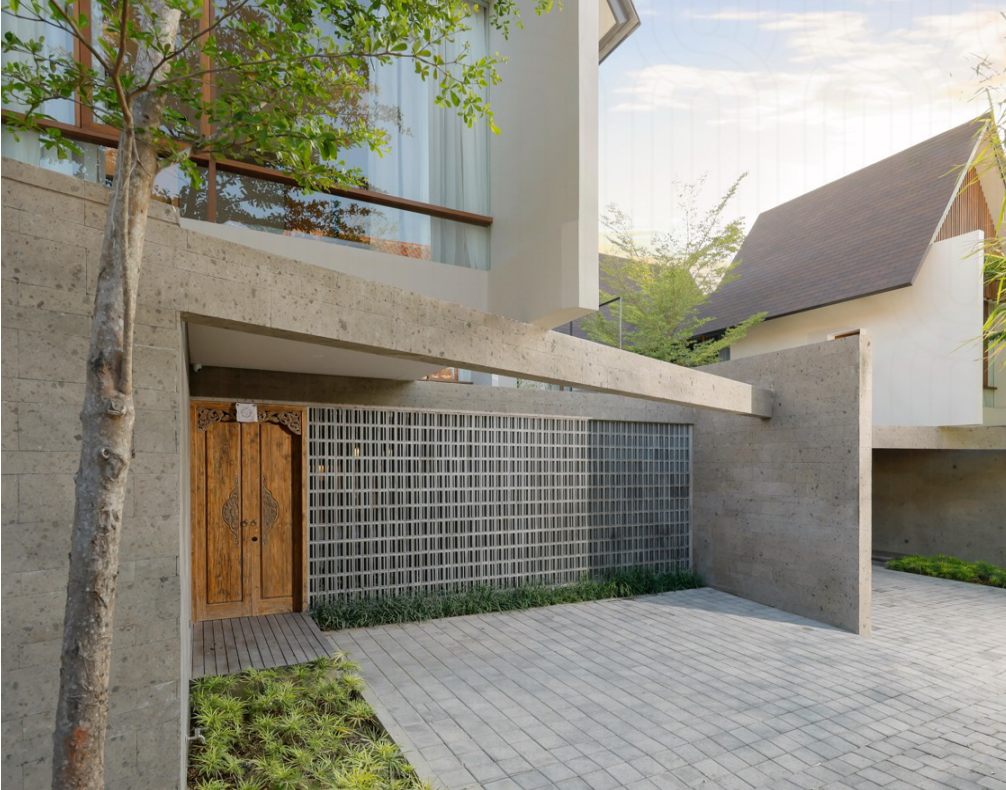
2 & 4-Bedrooms (9 Villas Compound)