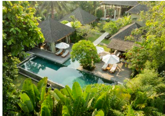
Villa Nelayan, 5-Bedrooms