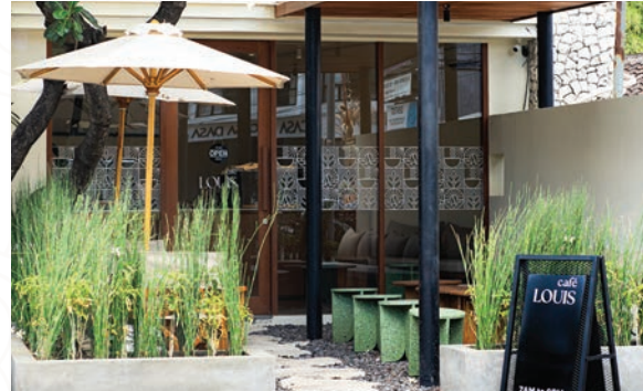
Cafe Louis (Coffee Shop)