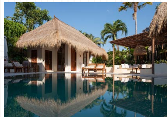
Villa Xanadu , 4-Bedrooms