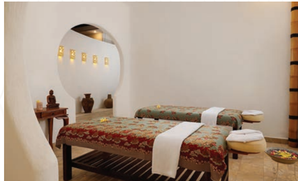
Mandala Puri Spa