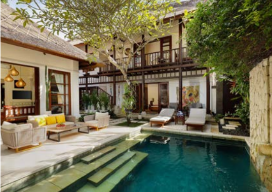
Villa Nayra , 3-Bedrooms