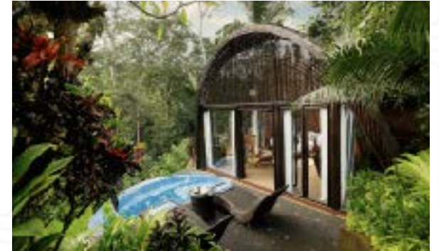
Private Pool with valley view