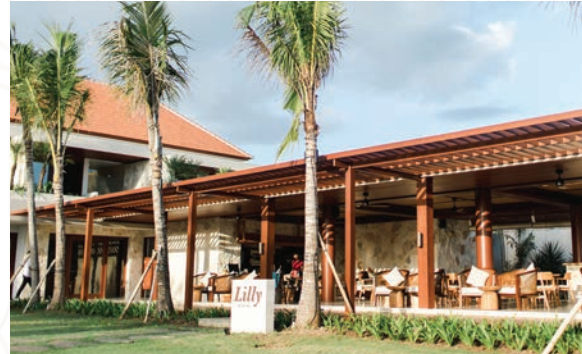
Lilly by The Sea Restaurant