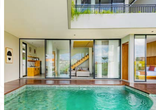
Villa Chanthira Luxe, 4-Bedrooms