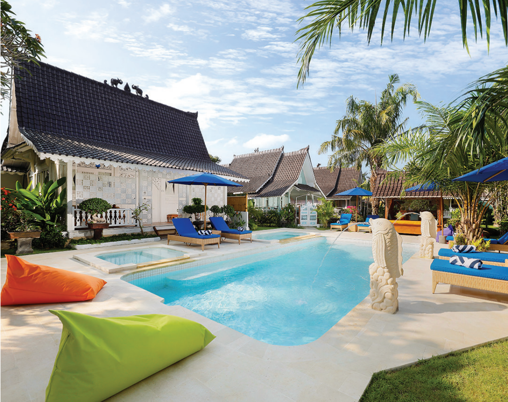
1, 2 & 3-Bedrooms