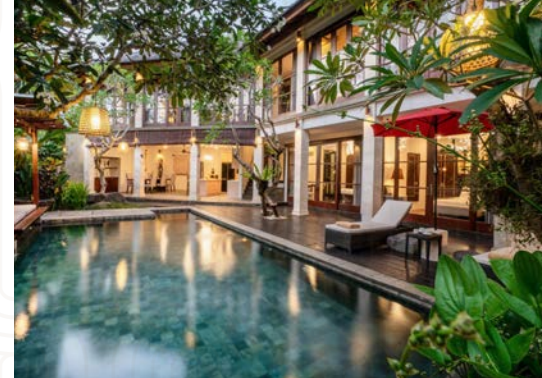
Villa Pulung , 3 Bedrooms