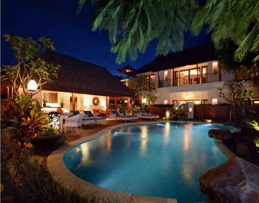
1 & 2-Bedrooms