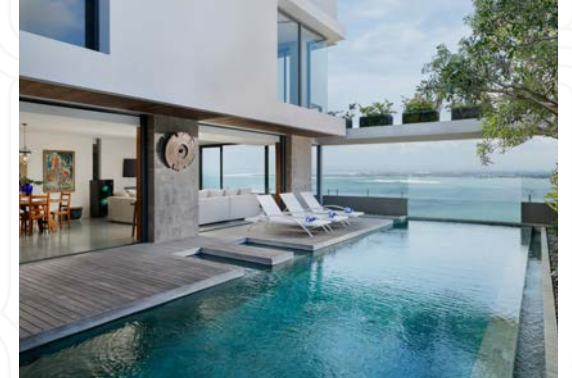
Santos Cliff View , 3-Bedrooms