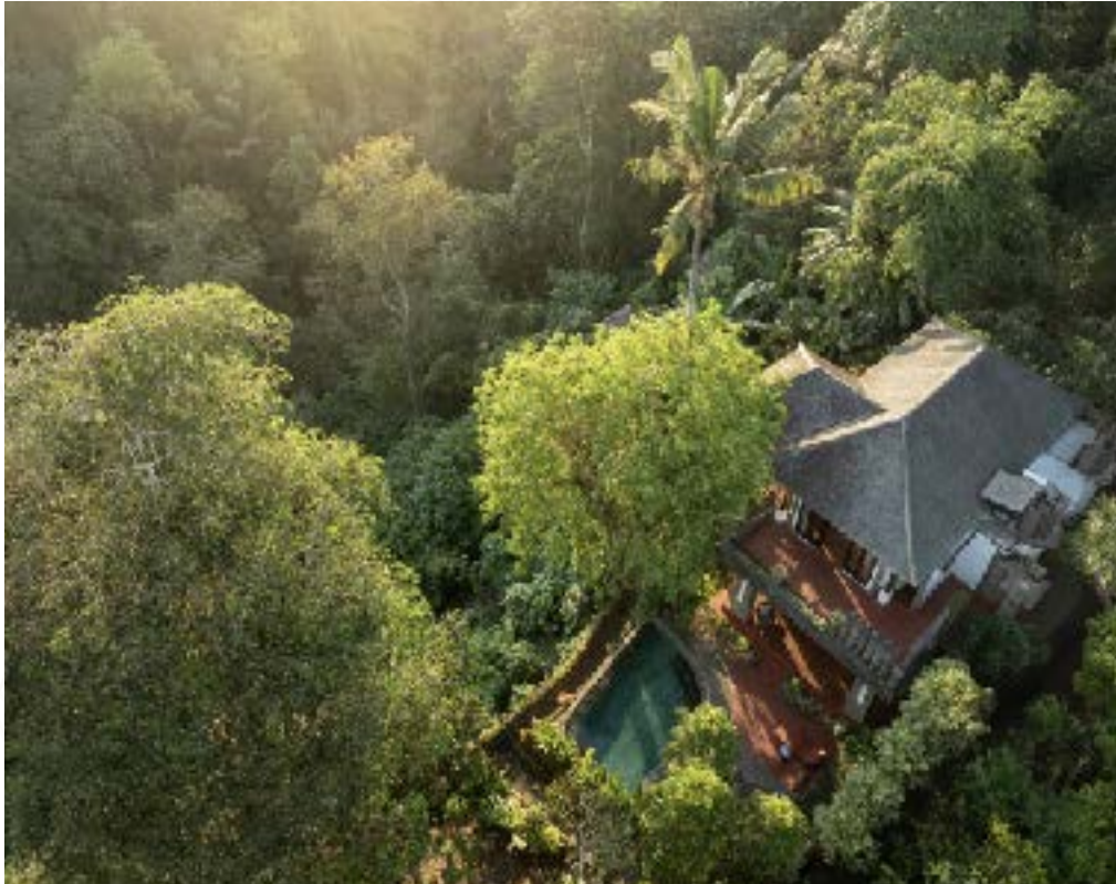
1, 2 & 5-Bedrooms (5 Villas Compound)