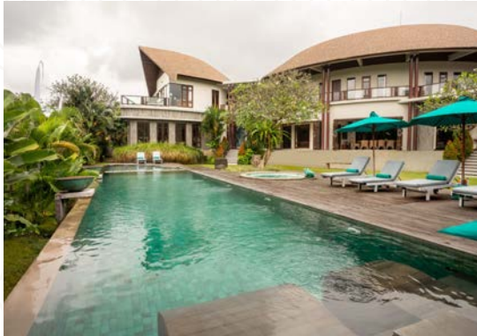
Villa Umah Daun , 5-Bedrooms