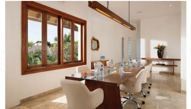
CO-Working & Meeting Room