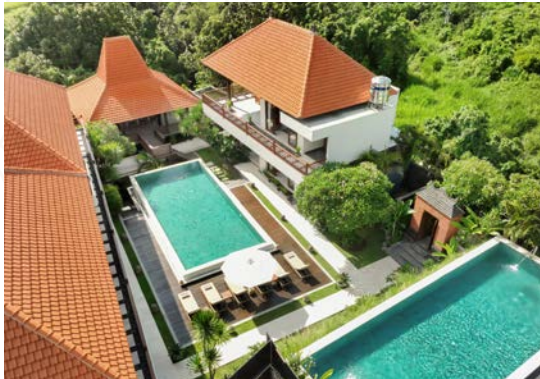
The Bija Villas , 3 & 6 Bedrooms