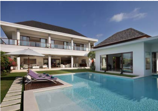
Villa Istana Putih, 5-Bedrooms