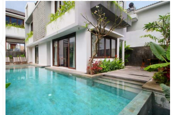
Villa Leceni , 4-Bedrooms