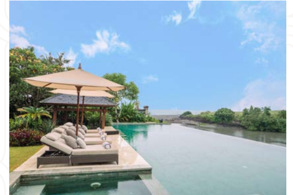
Villa Omekai , 4-Bedrooms