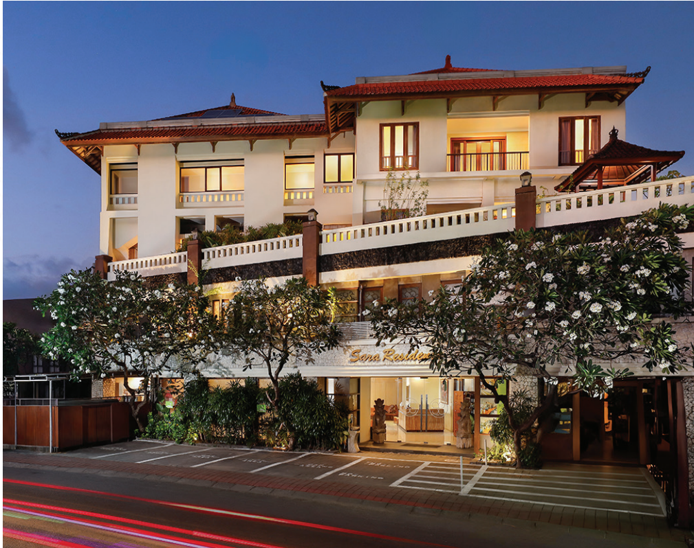
2 & 3-Bedrooms