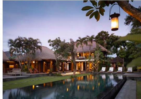
Villa Bangkuang , 5-Bedrooms