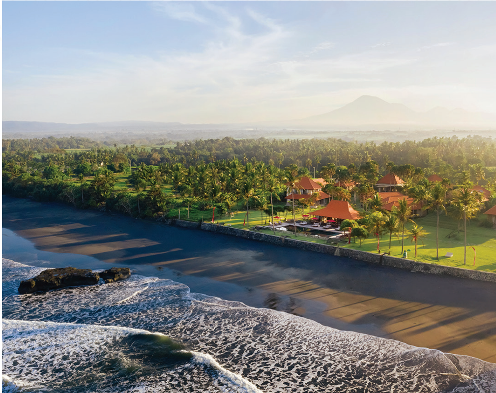
1 & 3-Bedrooms