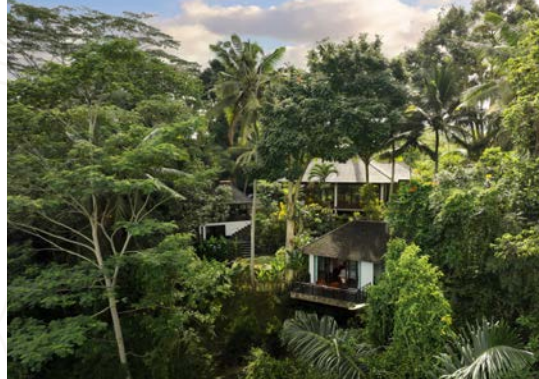
Villa Leona Suweta, 3-Bedrooms