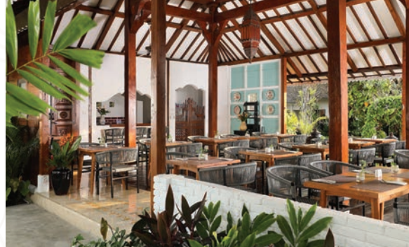
Pendopo Puri Restaurant