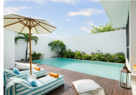
Kalem Villa Canggu , 4-Bedrooms