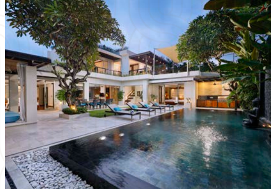
Villa Camellia , 3-Bedrooms