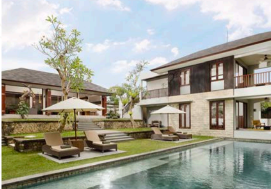
Villa Omekali, 3 Bedrooms