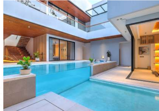
Villa Brandon, 6-Bedrooms