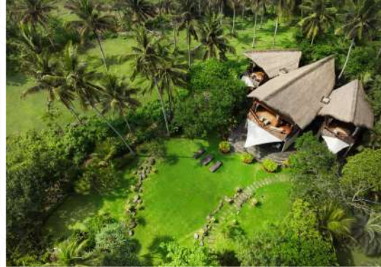
The Cove Bali, 5-Bedrooms