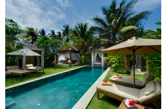
Villa Raj, 3-Bedrooms