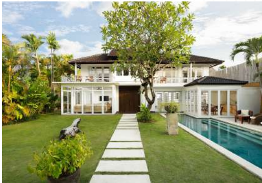
Villa Swarna, 5-Bedrooms