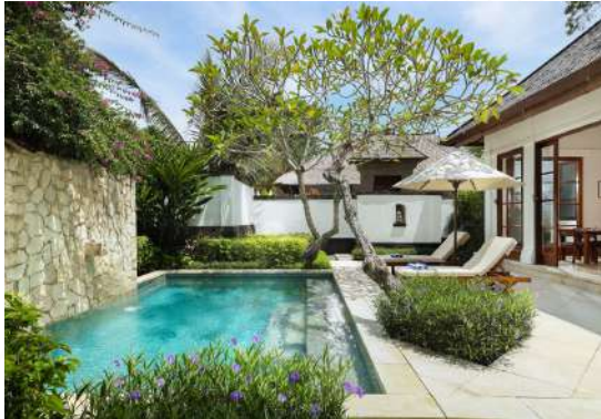
Villa Shanti, 3-Bedrooms