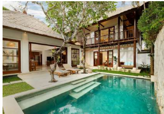
The Seven Villa, 3-Bedrooms