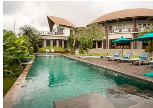
Villa Umah Daun, 5-Bedrooms