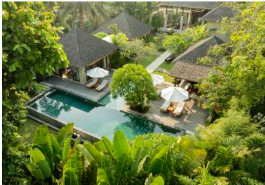
Villa Nelayan, 5-Bedrooms