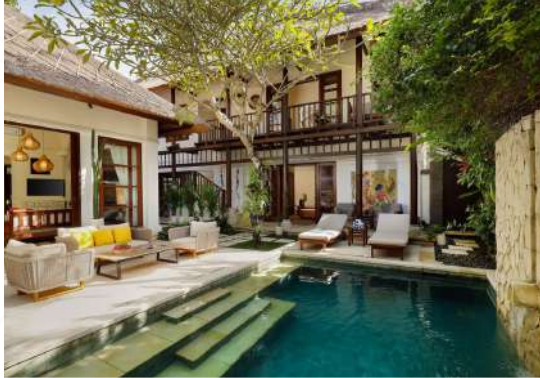
Villa Nayra, 3-Bedrooms