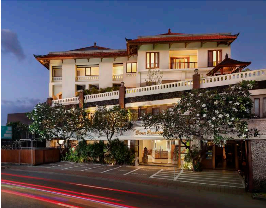
2 & 3-Bedrooms