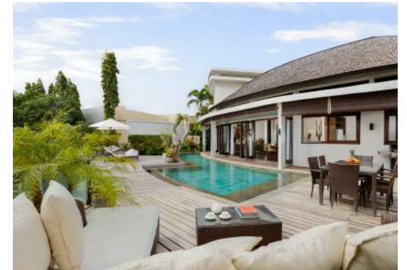
Villa Oshra, 4-Bedrooms