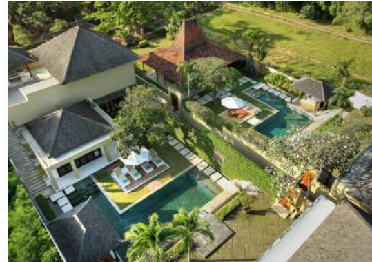
Villa Omega, 7-Bedrooms