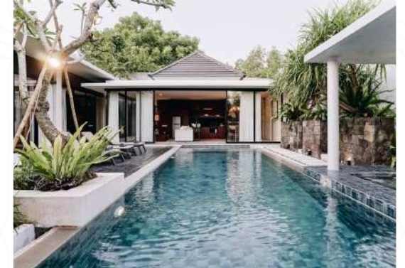
Villa Ambergris, 3-Bedrooms