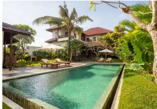
Villa Tropical Svasti, 5-Bedrooms