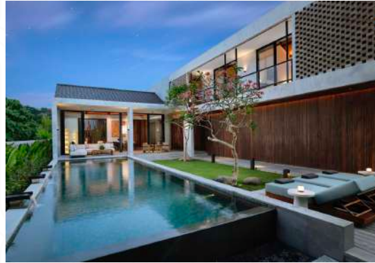
Uma Santai Canggu, 7-Bedrooms