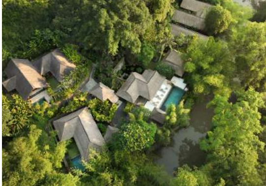
Villa Omecure, 6-Bedrooms