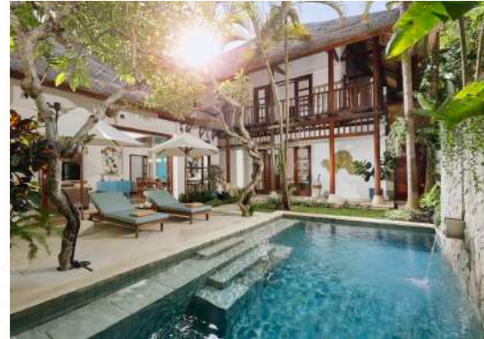
Villa Danis, 2-Bedrooms