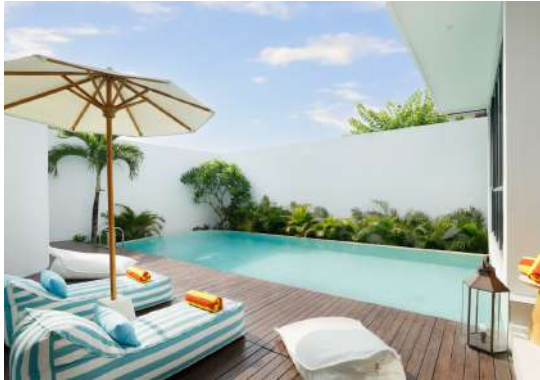
Villa Kalem Canggu, 4-Bedrooms