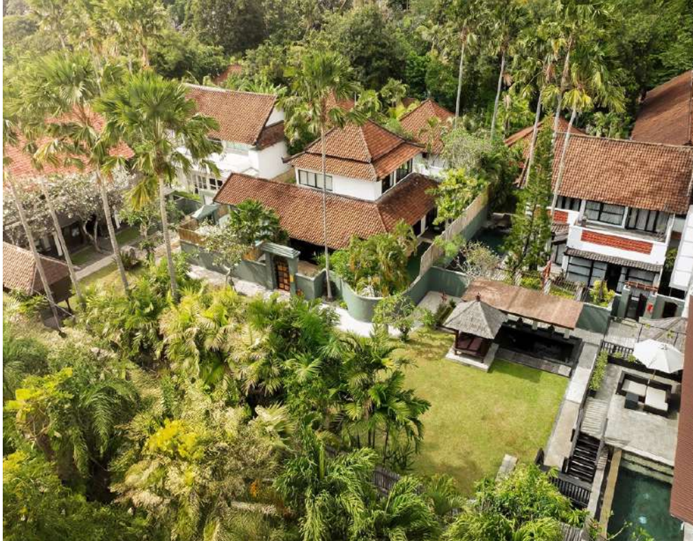
1, 2 & 3-Bedrooms (6 Villas Compound)