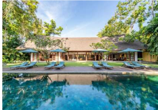
Villa Tirtadari, 7-Bedrooms