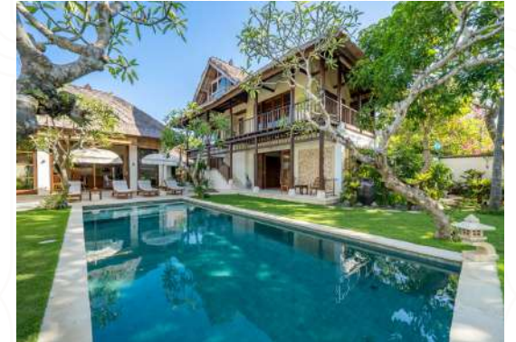
Villa Yasmine, 3-Bedrooms