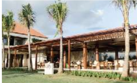
Lilly by The Sea Restaurant