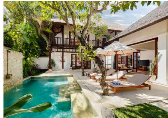
Villa Avaya, 3-Bedrooms