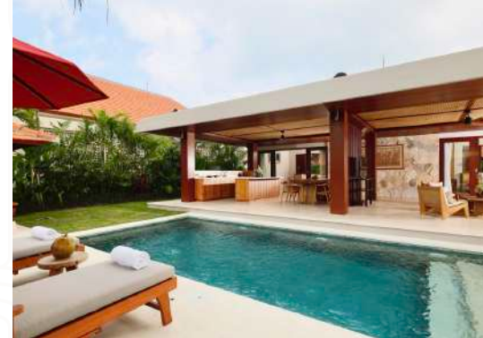
Villa Maya Pasut, 3-Bedrooms