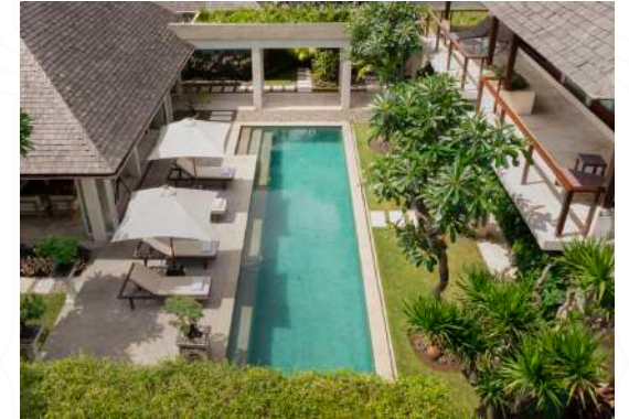
Villa Tenang, 5-Bedrooms