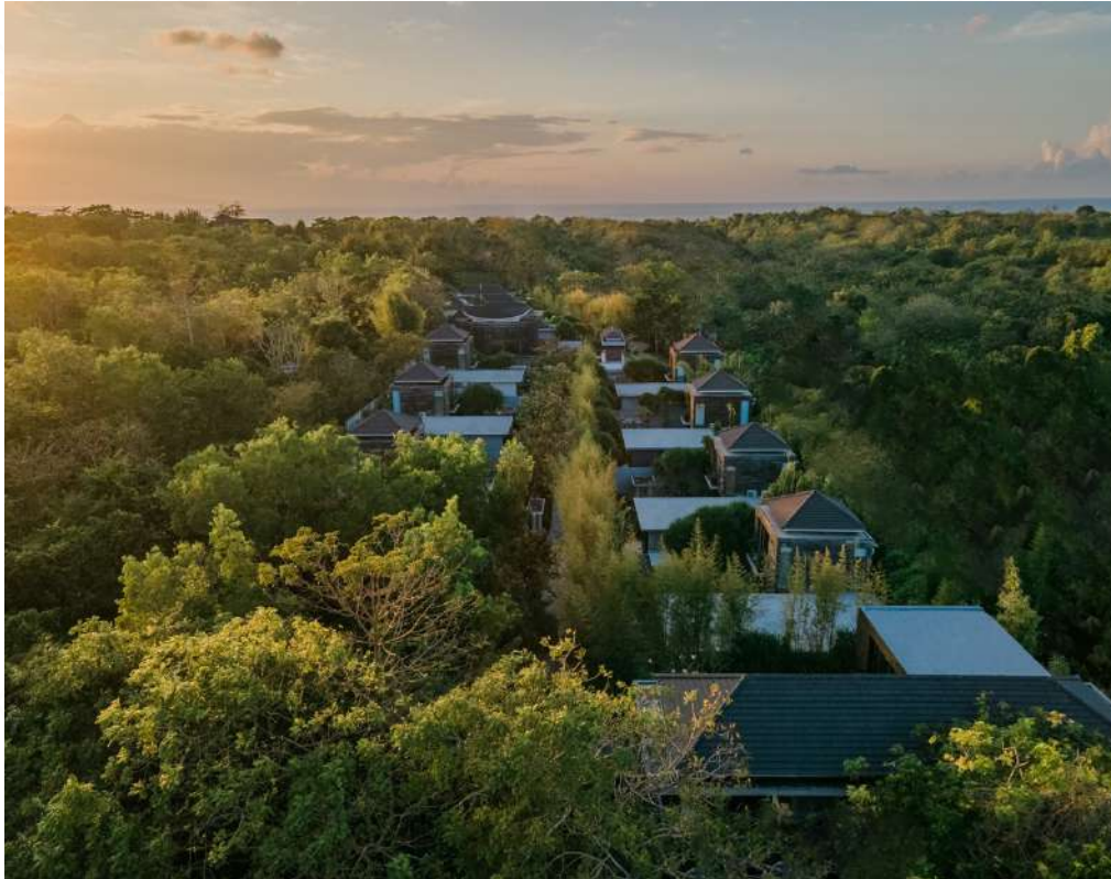
3 & 4-Bedrooms (10 Villas Compound)