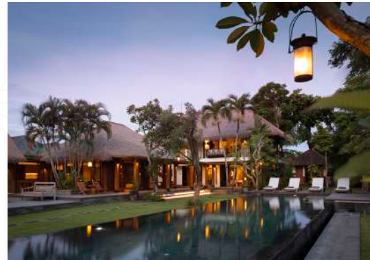
Villa Bangkuang, 5-Bedrooms