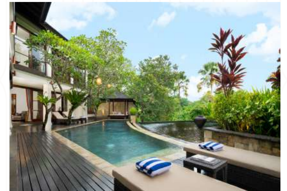
Villa Ambiente, 4 Bedrooms