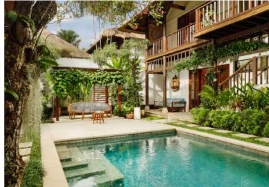
Villa Edward, 3-Bedrooms