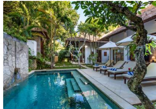
Villa Senada, 4-Bedrooms