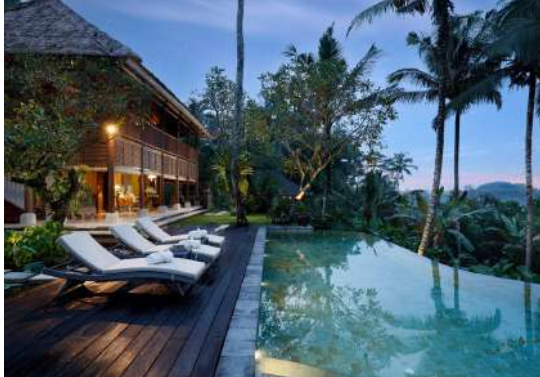
Villa Inka, 3-Bedrooms