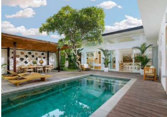
The Suar Sanur, 3-Bedrooms