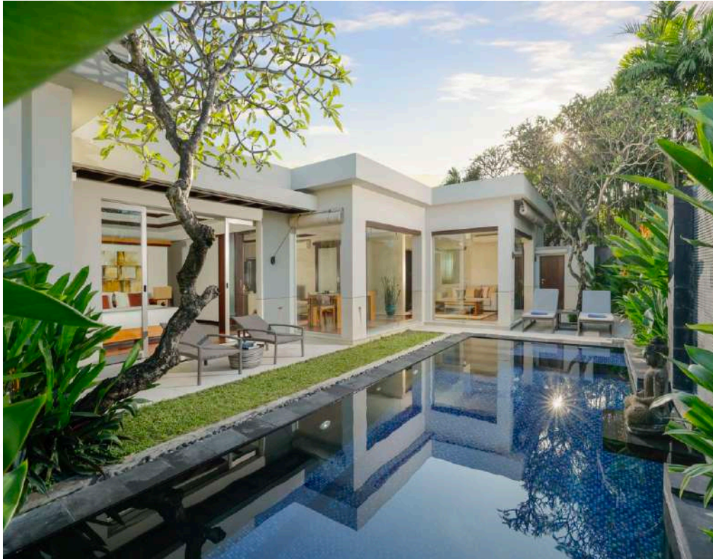
1 & 3-Bedrooms (4 Villas Compound)