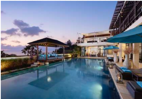
Villa Jamalu, 4-Bedrooms