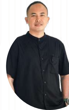
Adinata Corporate General Manager