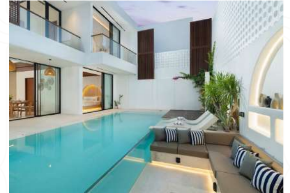
Fenta Villa, 3-Bedrooms