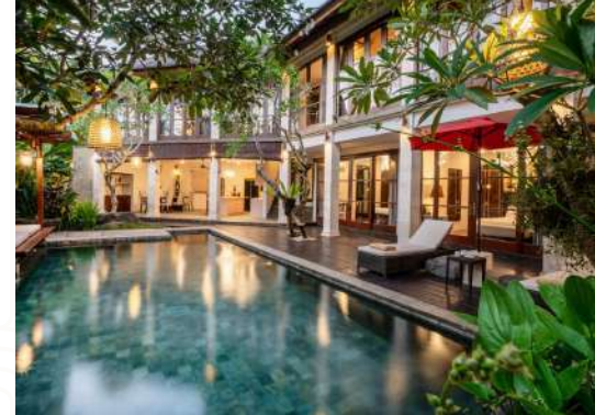
Villa Pulung, 3 Bedrooms