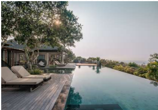
Shanti Residence, 7-Bedrooms