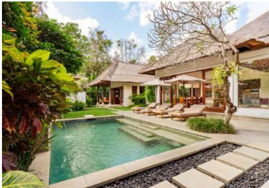
Villa Umarya, 4 Bedrooms