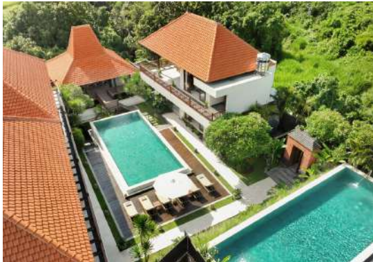
The Bija Villas, 3 & 6 Bedrooms