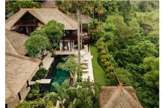
Villa Ken, 4-Bedrooms