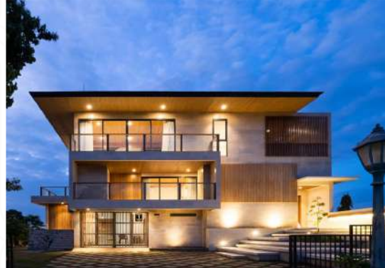
Villa Avocagolf, 4-Bedrooms