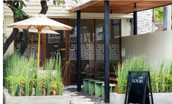
Cafe Louis (Coffee Shop)