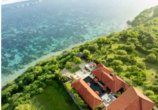
Villa Nagasutra, 7-Bedrooms