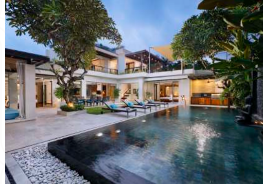
Villa Camellia, 3-Bedrooms