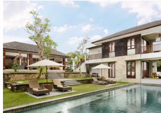
Villa Omekali, 3 Bedrooms