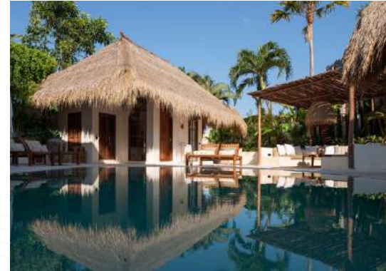
Villa Xanadu, 4-Bedrooms