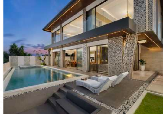
Villa Kalem Uluwatu, 4-Bedrooms