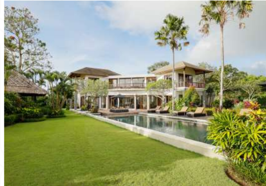
Villa Uma Nina, 6-Bedrooms