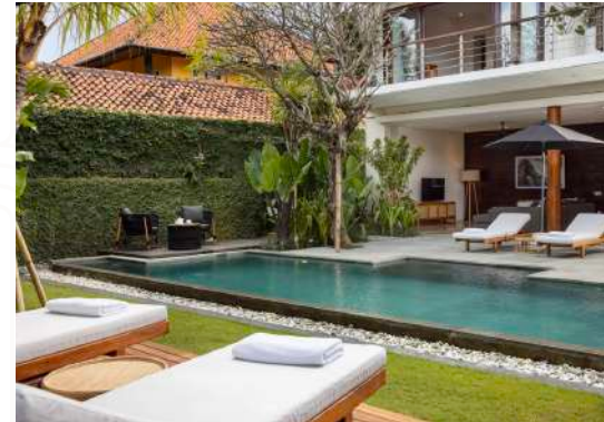
Villa Ambara, 3-Bedrooms