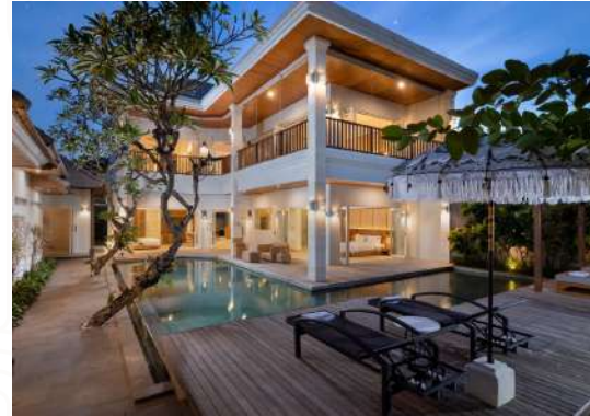
Villa Christie, 5-Bedrooms