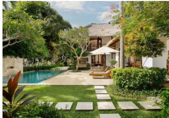
Villa OHM, 4-Bedrooms