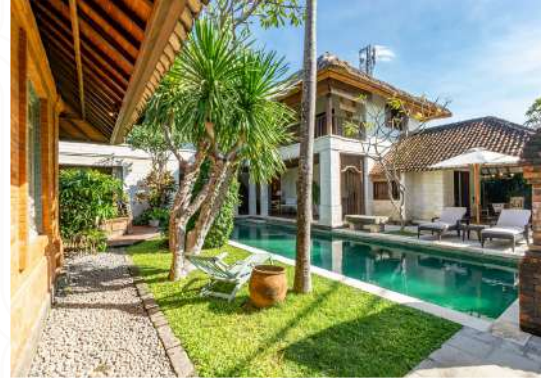
Villa Angsa, 4-Bedrooms