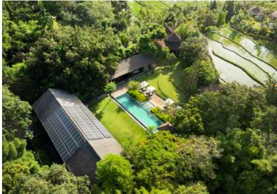
Villa Amita, 7-Bedrooms