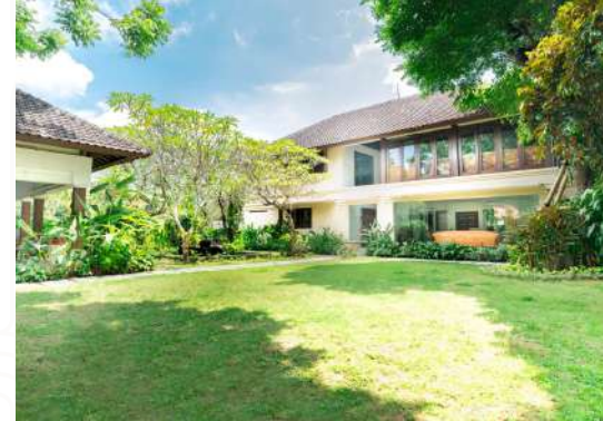
Asraya Villa, 3-Bedrooms