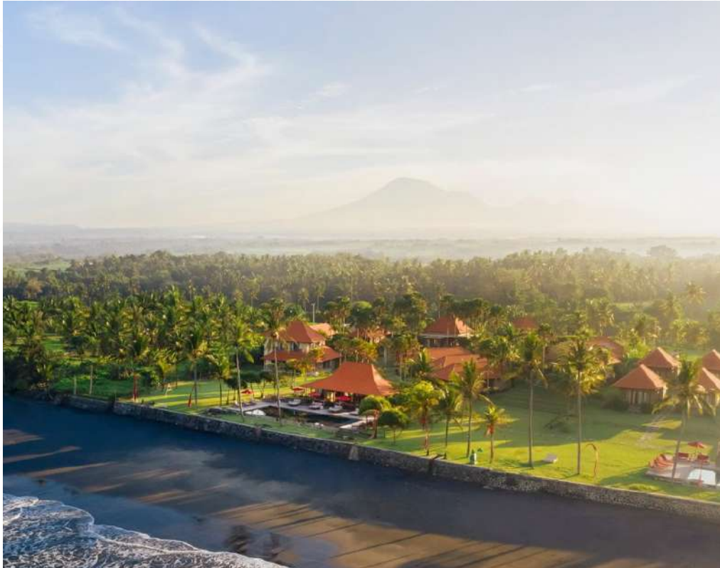
1 & 3-Bedrooms