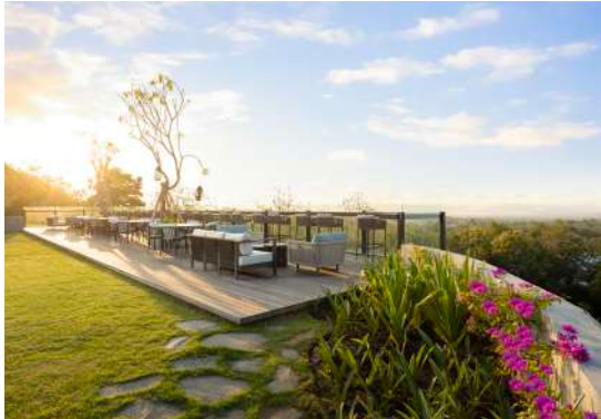
The Tulou Bali, 10-Bedrooms