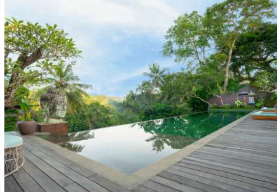
Villa Le Sunset, 8-Bedrooms