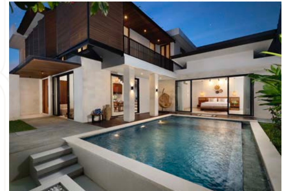
Villa Ananya, 4-Bedrooms