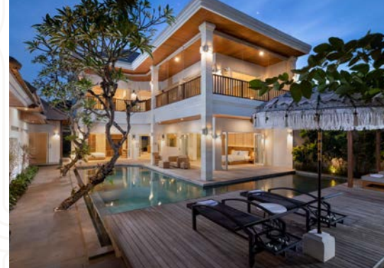
Villa Christie, 5-Bedrooms