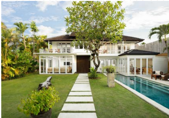
Villa Swarna, 5-Bedrooms