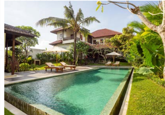
Villa Tropical Svasti, 5-Bedrooms