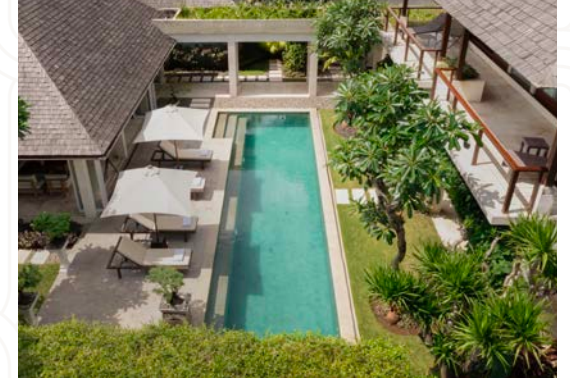
Villa Tenang, 5-Bedrooms