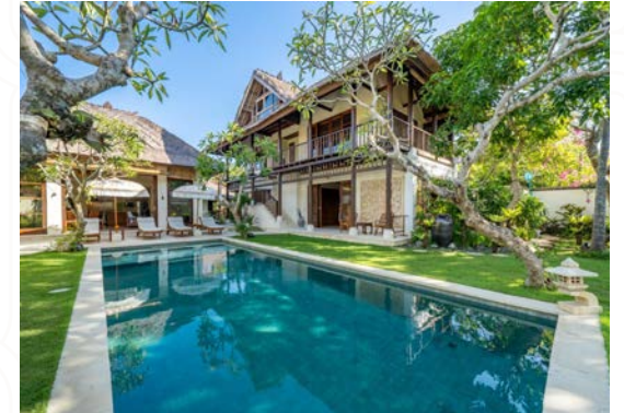
Villa Yasmine, 3-Bedrooms