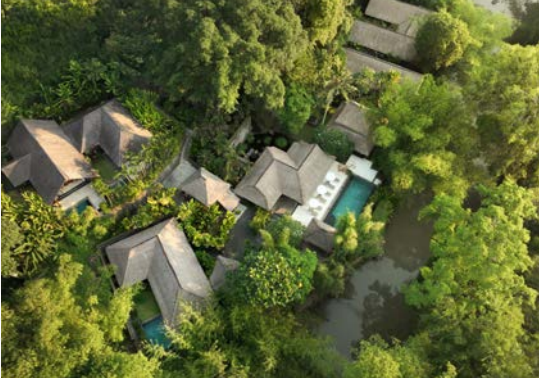
Villa Omecure, 6-Bedrooms