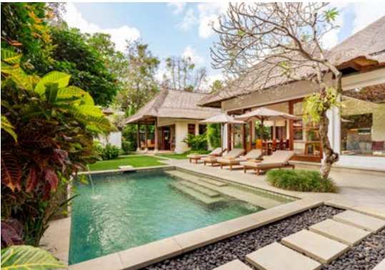
Villa Umarya, 4 Bedrooms