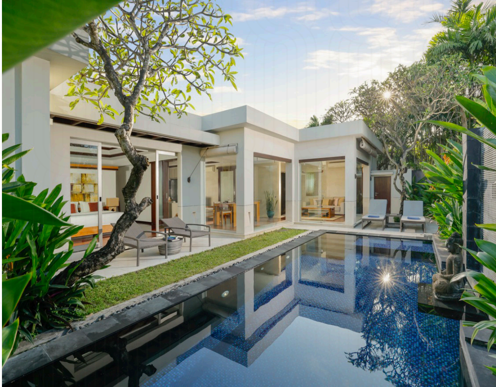
1 & 3-Bedrooms (4 Villas Compound)