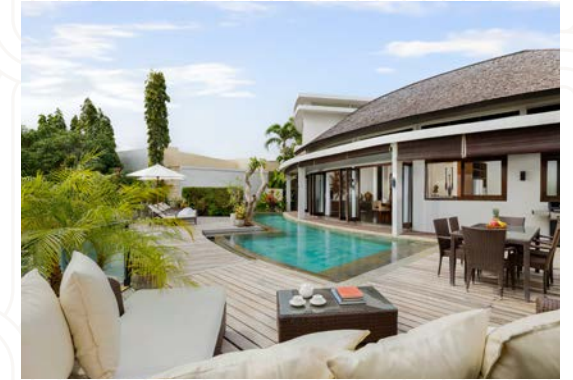
Villa Oshra, 4-Bedrooms