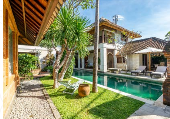
Villa Angsa, 4-Bedrooms