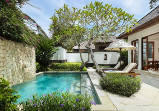
Villa Shanti, 3-Bedrooms