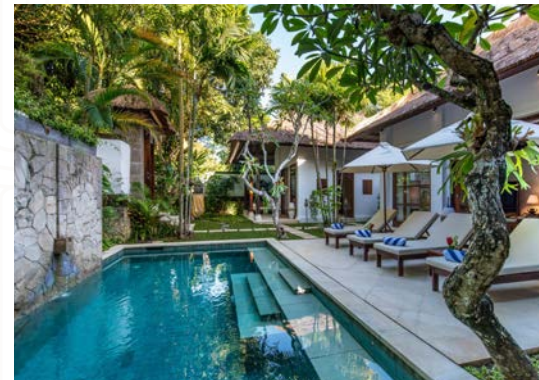
Villa Senada, 4-Bedrooms