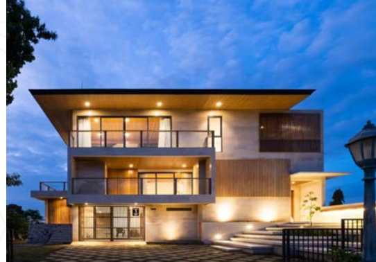
Villa Avocagolf, 4-Bedrooms