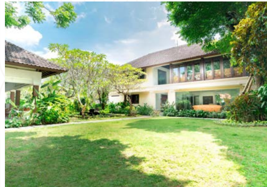
Asraya Villa, 3-Bedrooms