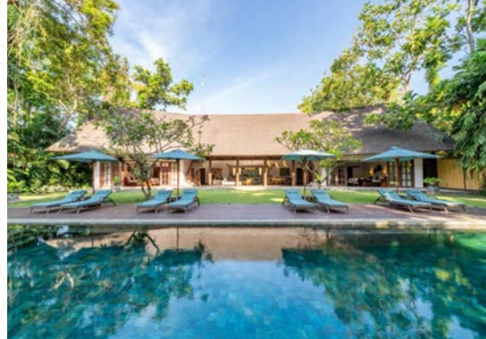
Villa Tirtadari, 7-Bedrooms