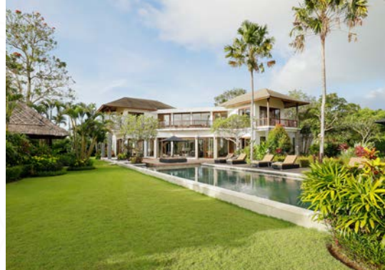
Villa Uma Nina, 6-Bedrooms