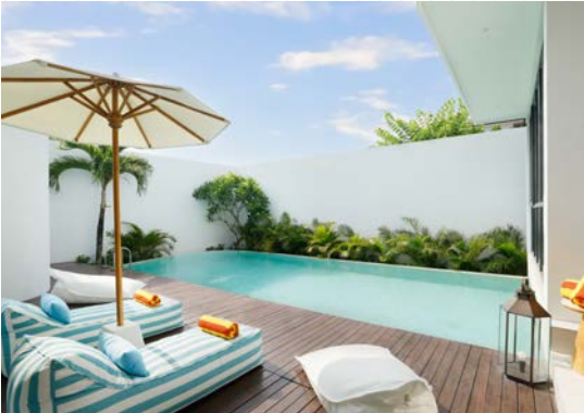
Villa Kalem Canggu, 4-Bedrooms