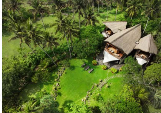
The Cove Bali, 5-Bedrooms