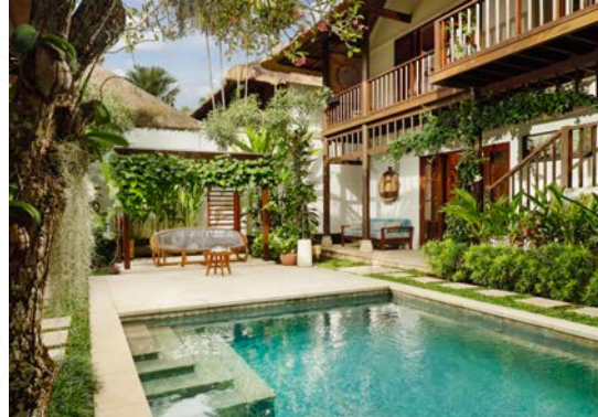
Villa Edward, 3-Bedrooms