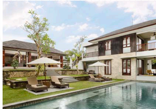
Villa Omekali, 3 Bedrooms