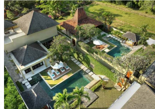
Villa Omegia, 7-Bedrooms