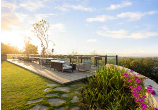
The Tulou Bali, 10-Bedrooms