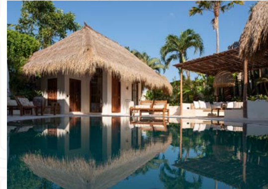
Villa Xanadu, 4-Bedrooms