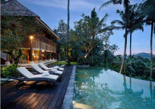
Villa Inka, 3-Bedrooms