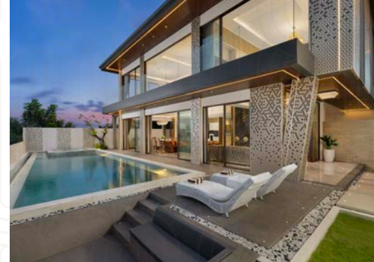
Villa Kalem Uluwatu, 4-Bedrooms