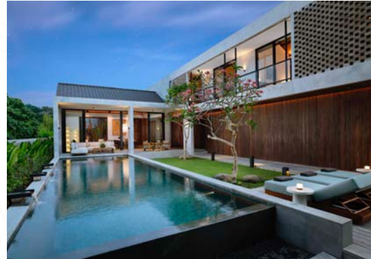
Uma Santai Canggu, 7-Bedrooms