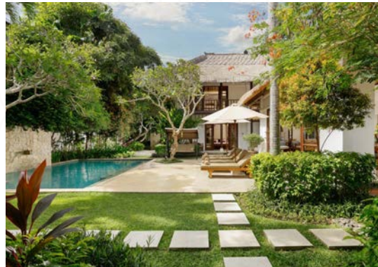
Villa OHM, 4-Bedrooms