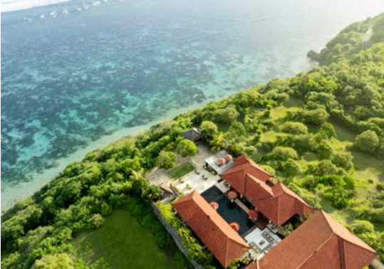
Villa Nagasutra, 7-Bedrooms