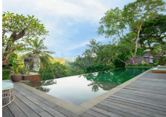
Villa Le Sunset, 8-Bedrooms