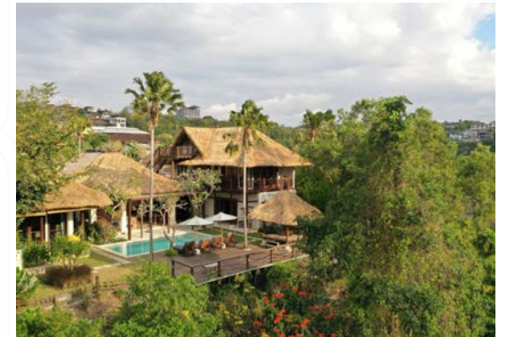
Villa Grasshopper, 3-Bedrooms