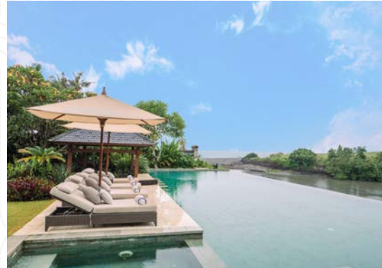
Villa Omekai, 4-Bedrooms