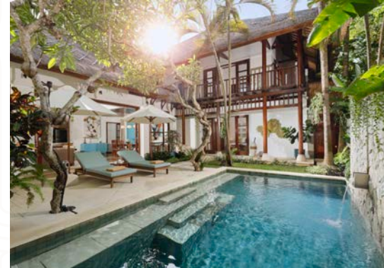
Villa Danis, 2-Bedrooms