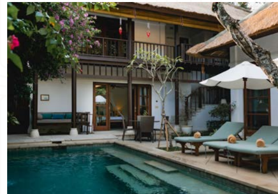
Villa Gracie, 3-Bedrooms