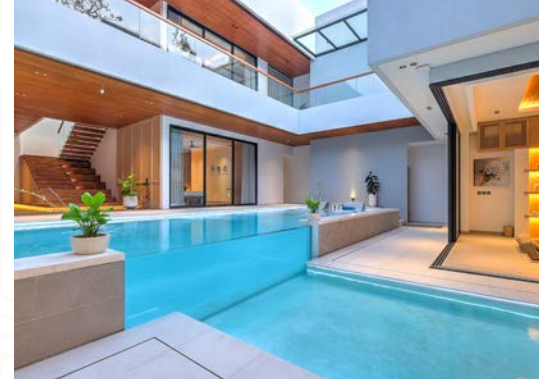
Villa Brandon, 6-Bedrooms