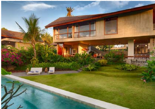
Villa caSabama, 3 & 4-Bedrooms