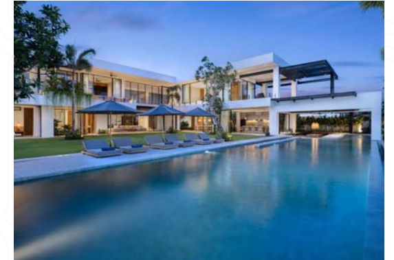
Arita Villa, 6-Bedrooms