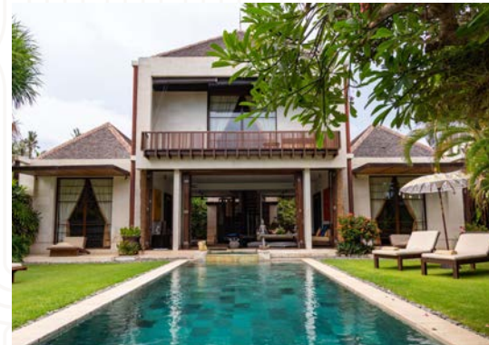
Villa Nataraja, 3-Bedrooms