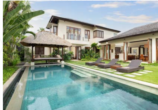
The Suar Seminyak, 5-Bedrooms