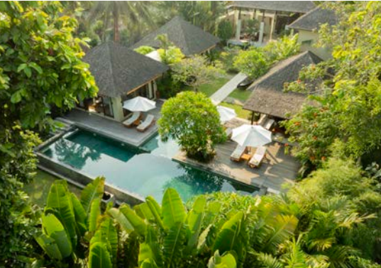
Villa Nelayan, 5-Bedrooms