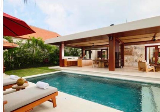
Villa Maya Pasut, 3-Bedrooms