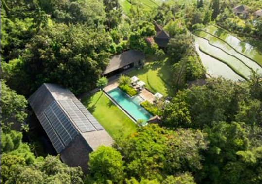
Villa Amita, 7-Bedrooms