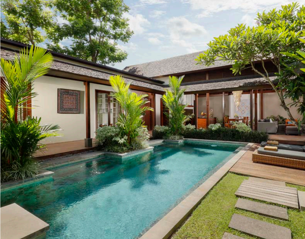
2 & 3-Bedrooms (10 Villas Compound)