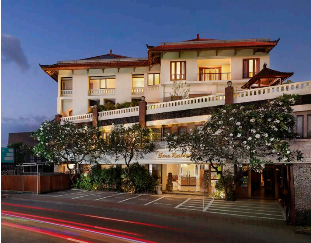
2 & 3-Bedrooms