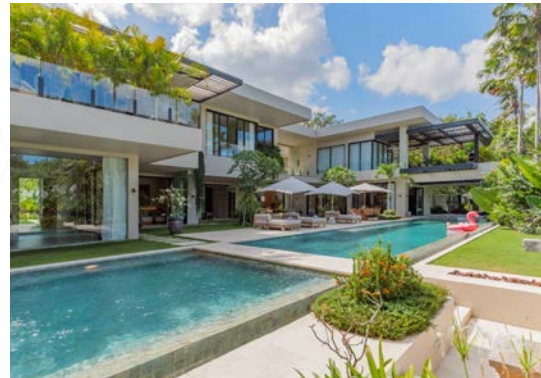
Villa Morada, 5-Bedrooms