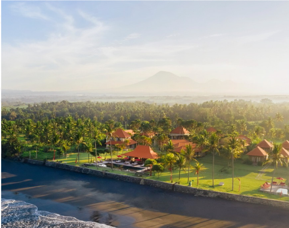
1 & 3-Bedrooms