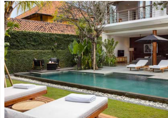
Villa Ambara, 3-Bedrooms