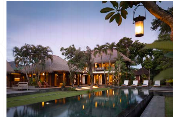
Villa Bangkuang, 5-Bedrooms