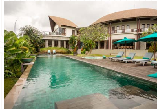
Villa Umah Daun, 5-Bedrooms