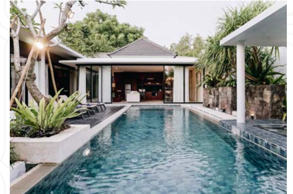
Villa Ambergris, 3-Bedrooms