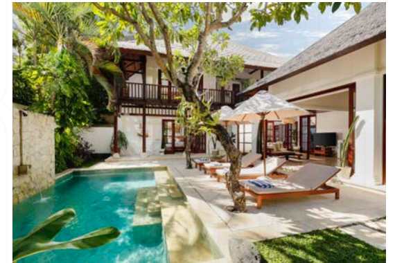
Villa Avaya, 3-Bedrooms