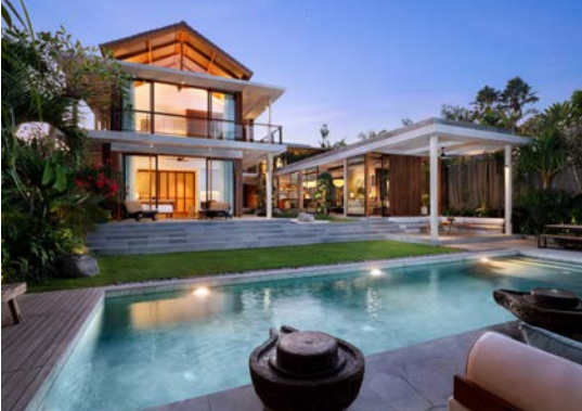
Uma Santai Pererenan, 7-Bedrooms