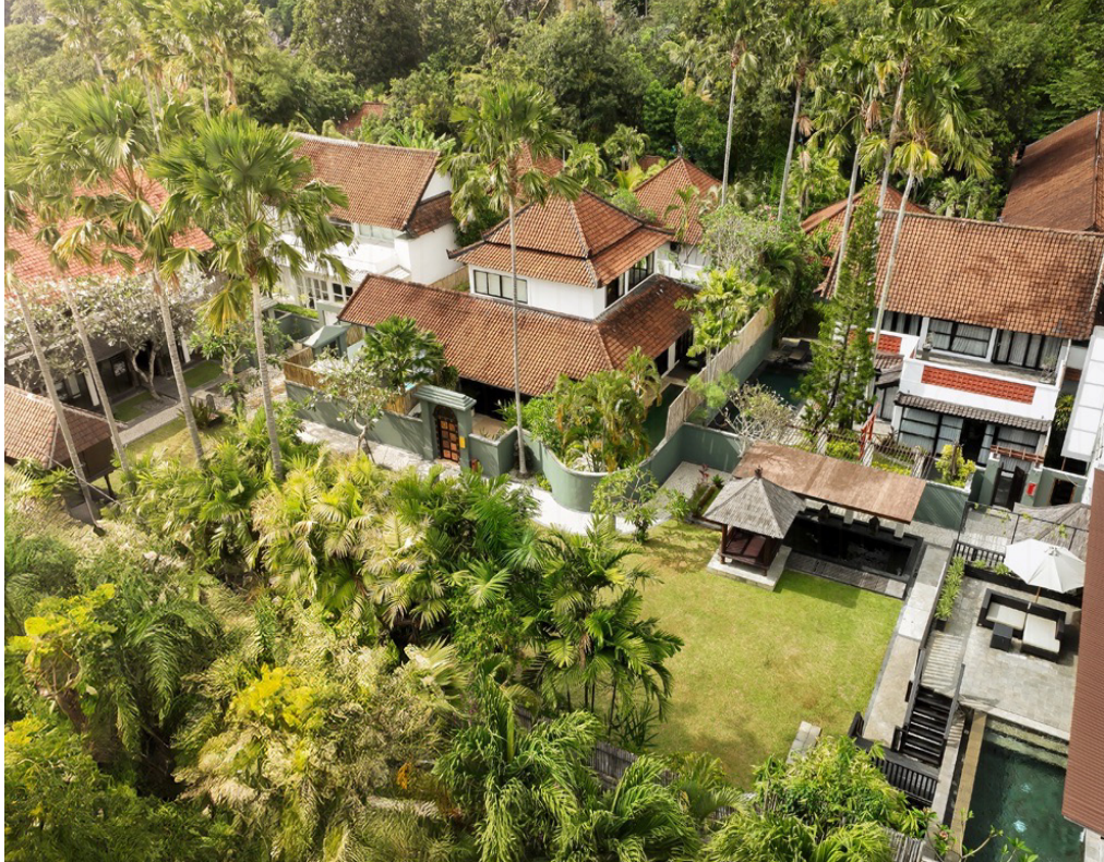
1, 2 & 3-Bedrooms (6 Villas Compound)