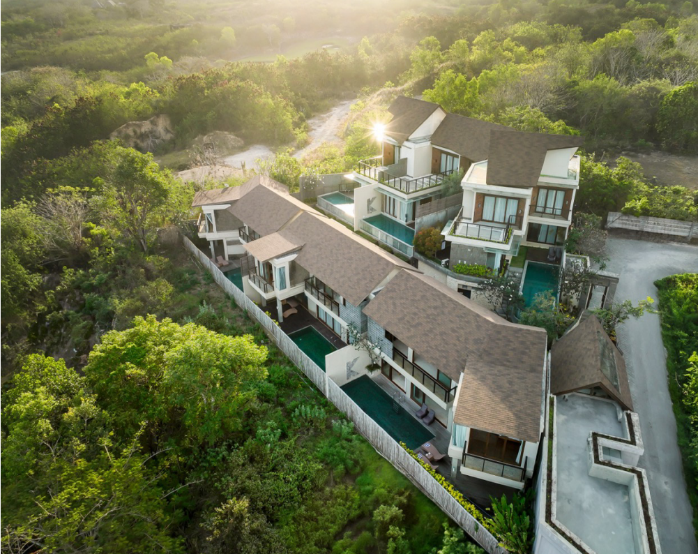
3-Bedrooms (6 Villas Compound)