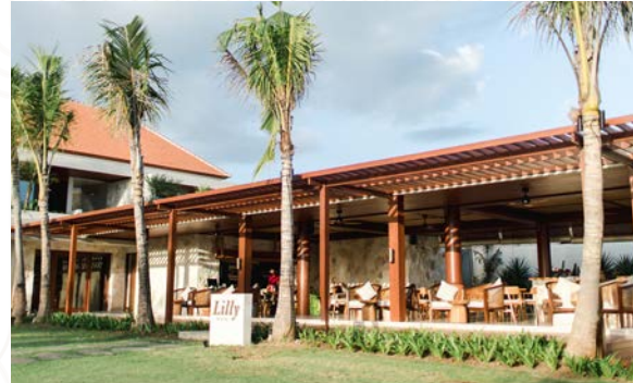
Lilly by The Sea Restaurant