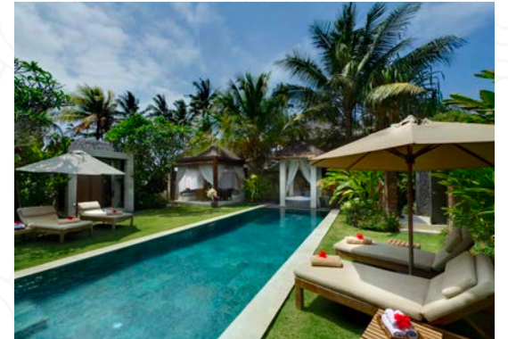
Villa Raj, 3-Bedrooms