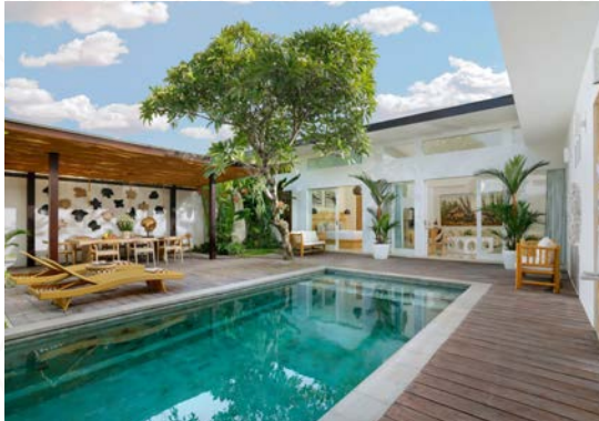
The Suar Sanur, 3-Bedrooms