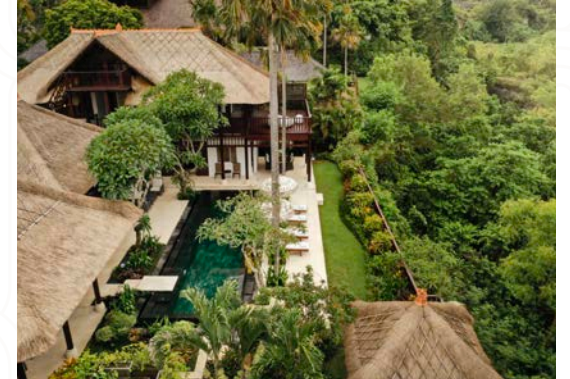
Villa Ken, 4-Bedrooms