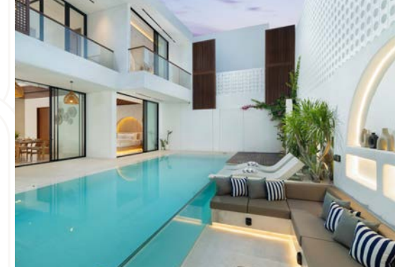
Fenta Villa, 3-Bedrooms