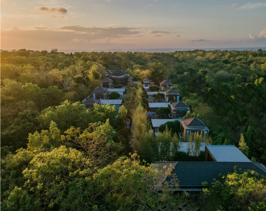
3 & 4-Bedrooms (10 Villas Compound)