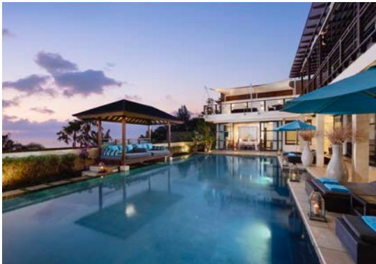
Villa Jamalu, 4-Bedrooms