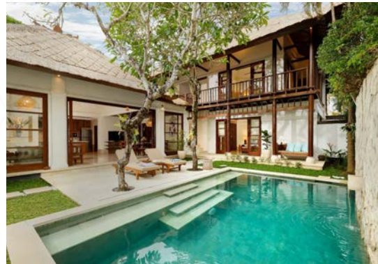
The Seven Villa, 3-Bedrooms