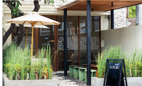
Cafe Louis (Coffee Shop)